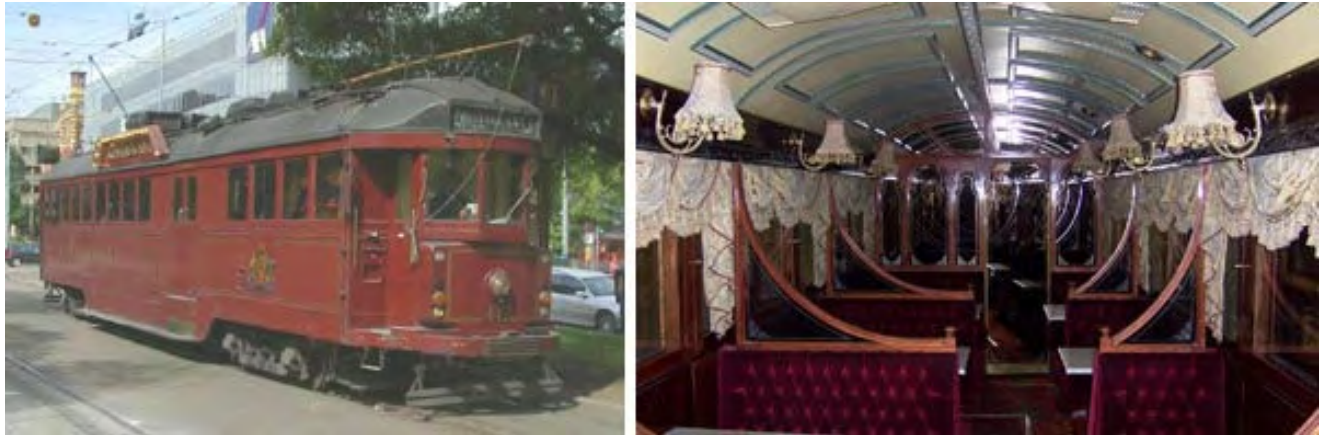
W2 442 as the Restaurant tram – Victoria Parade

Melbourne's first Restaurant tram, W2 442 retired from active service during 2006 has been formally transferred to VicTrack's ownership. It will be considered as part of the Heritage fleet and when possible moved to Hawthorn. The tram originally entered service during 1927, was the last W2 to receive a major overhaul during 1980 and ran from Kew Depot. Converted during 1982, it entered service as the Restaurant tram on 2 November 1982 and operated by the Colonial Tramcar Company*. The tram remains basically complete.