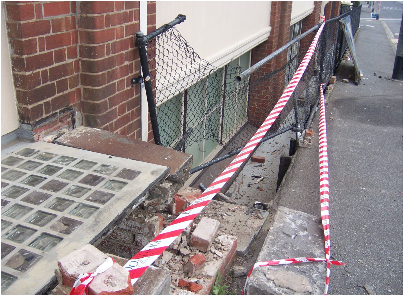
A view of the external damage done by an errant motor vehicle to the Wallen Road side of the Hawthorn Depot Building on the evening of 24 April 2009

From the photos, it seems the driver had a lucky escape from a plunge into the main room through the skylight.