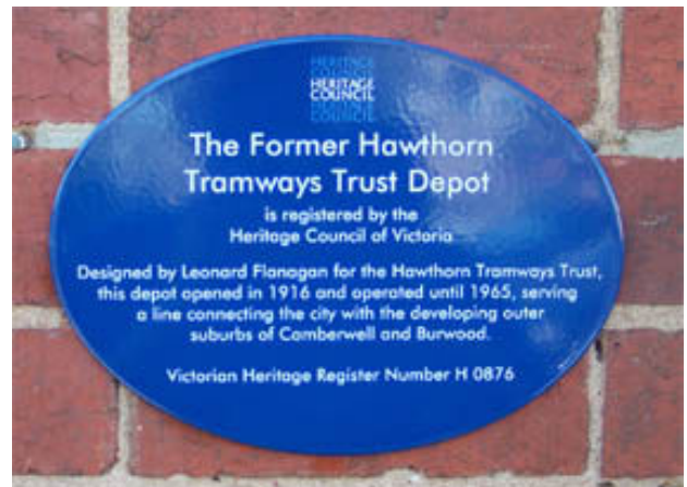
A close-up of the Heritage Plaque for the Hawthorn Tram Depot building – Photo Warren Doubleday.