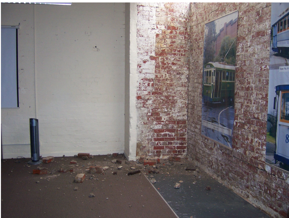
The main room of the museum, after the accident of the 24 April 2009, showing the debris that fell through the skylight.

While Friends of Hawthorn Tram Depot wishes to encourage more visitors to drop in to the museum, this wasn't what we quite had in mind!