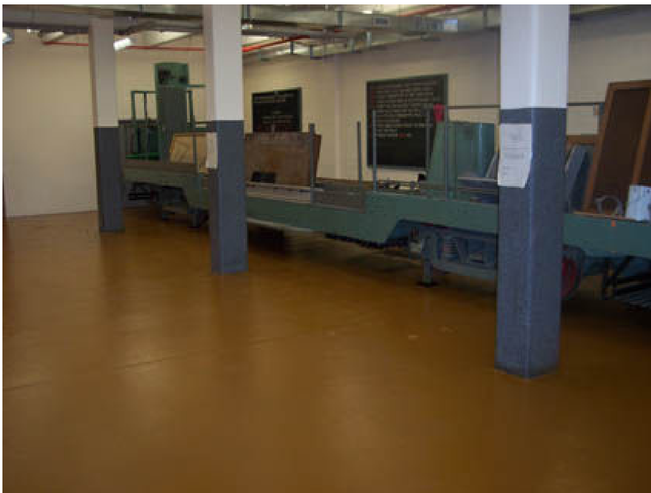
The freshly repainted floor of the driver training room reproducing the familiar tan of State Government linoleum, with the driver training car in the background – Photo Warren Doubleday.