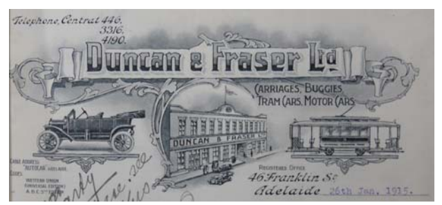
Original letterhead from Duncan & Fraser Limited, tramcar body builders extraordinaire – from a letter written to the Hawthorn Tramways Trust dated 26 Jan 1915. Duncan & Fraser constructed many of the tramway trust cars for the PMTT, HTT and MBCTT.

It is with a little sadness that we bid the former franchisee good-bye, and wish departing staff all the best in their future careers.