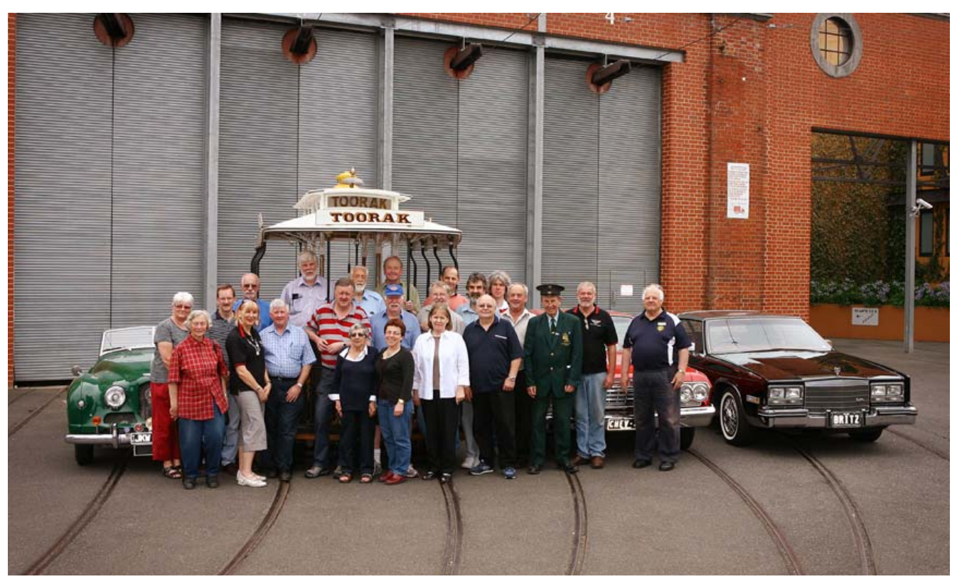
Chevrolets to the left of them, Jowetts to the right: Members from FOHTD, the Jowett Car Club and the Chevrolet Car Club of Victoria on the depot fan on Saturday 21 November, during their special open day visit.