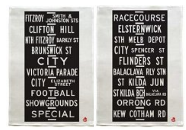
Fitzroy and St Kilda destination roll tea towels

The latest additions to our shop are quality teal towels inspired by vintage tram destination blinds, from Poulier and Poulier Design. Ideal for framing. Made with 100% premium quality linen, they are an ideal seasonal gift. Interestingly enough, the most popular of the tea-towel range is based on the Kew roll. We will let you figure out why.