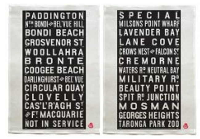
Sydney destination roll tea-towels from both sides of the Harbour – Bondi and Mosman.

Priced at $26 each, these are sure to go down well in the kitchen – or for the real enthusiast, they can be framed for display. And if you don't want a Melbourne tea-towel, we have Sydney-based teatowels as well – at a lower prices than any other outlet in town.