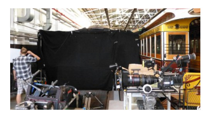
Interior filming for Underbelly inside the depot.

Filming was facilitated through the efforts of Yarra Trams and VicTrack.