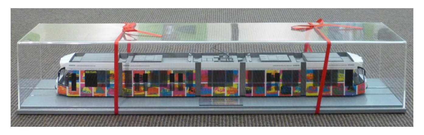
Siemens D2 class tram model donated by Ron Scholten.