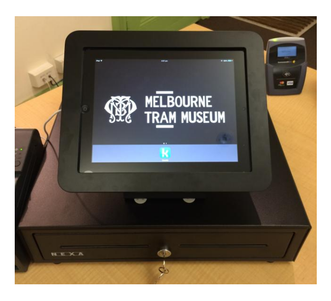
Our new sales technology - the Kounta cash register.

Pop along on one of our open days to pick up your copies of these two exciting new publications, or send us a mail order using the form on our <u>website</u>. Remember we accept both MasterCard and Visa credit cards.