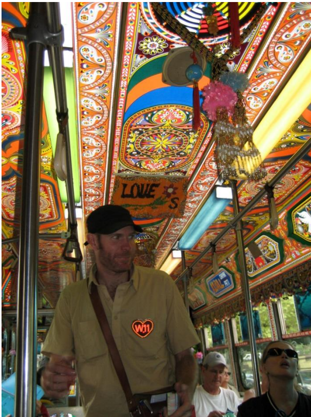
Interior detail of Karachi W11 on 2 March 2007 on City Circle service, with matching conductor dispensing souvenir tickets.

the prototype tram PCC 1041. This was the first time since the 1920s that the M&MTB had contracted out construction of complete trams, although final fit out of the new tramcars was carried out at the M&MTB Preston Workshops. The eventual success of the Z class program meant that the Board would never again build its own trams.