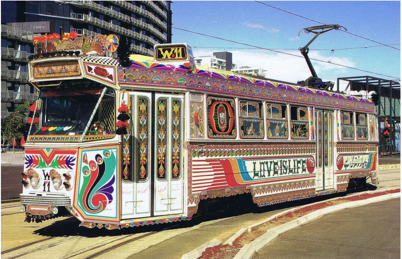
Karachi W11 in all its ornate glory in Docklands on 16 March 2006.

Journal of the Friends of Hawthorn Tram Depot