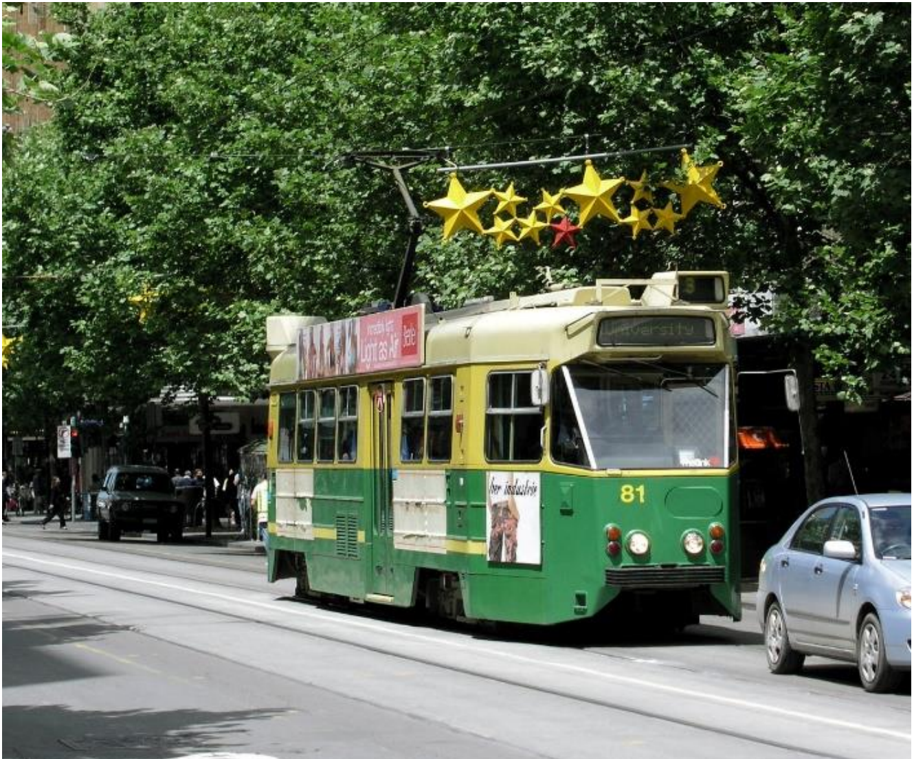
Z1 81 still in faded Met green and yellow, in Swanston Street on 10 November 2005. It had only a few weeks to run before its withdrawal from regular service for transformation into Karachi W11.

funding. No new trams were built by the M&MTB over the period from 1956 until 1973, even though the majority of the tram fleet dated from the 1920s. Similarly, there was no extension to the tram network between 1956 and 1973.