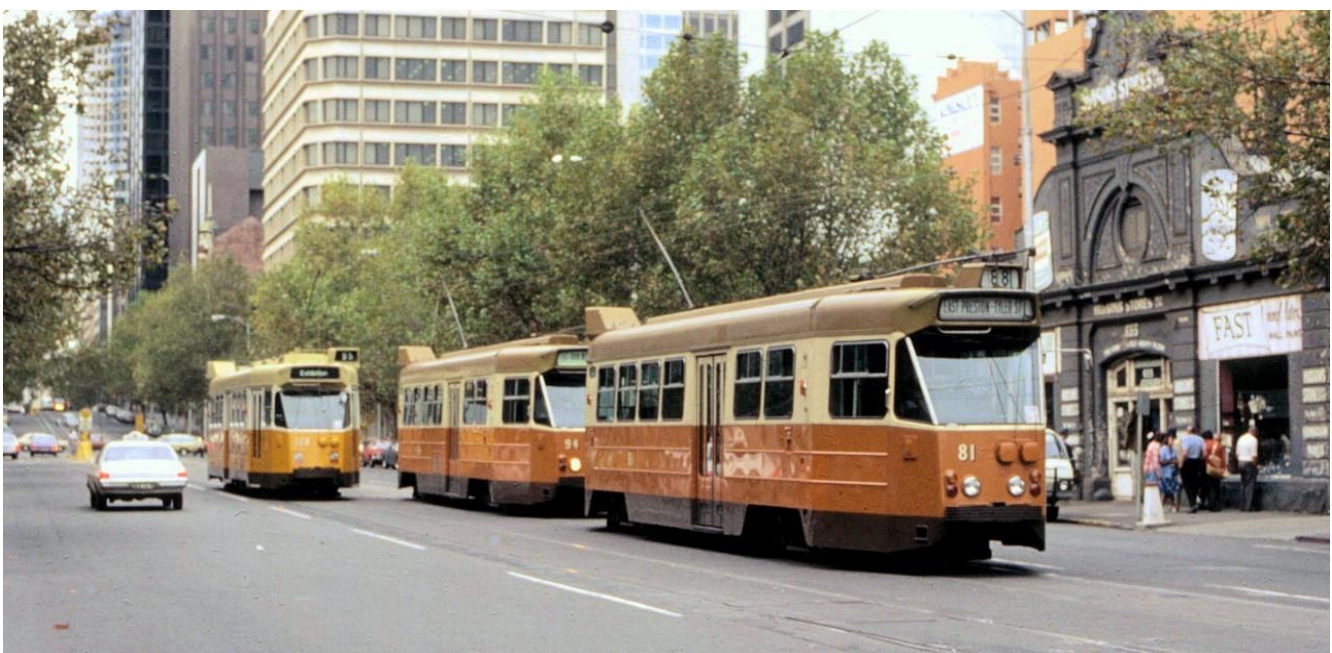
Z1 81 wearing its original orange M&MTB livery at the Spencer St terminus in Bourke Street on 21 April 1980, in front of Z1 94 and Z3 129.

With the ascent to power of Henry Bolte as Premier of Victoria in 1955, the Melbourne & Metropolitan Tramways Board (M&MTB) was starved of capital