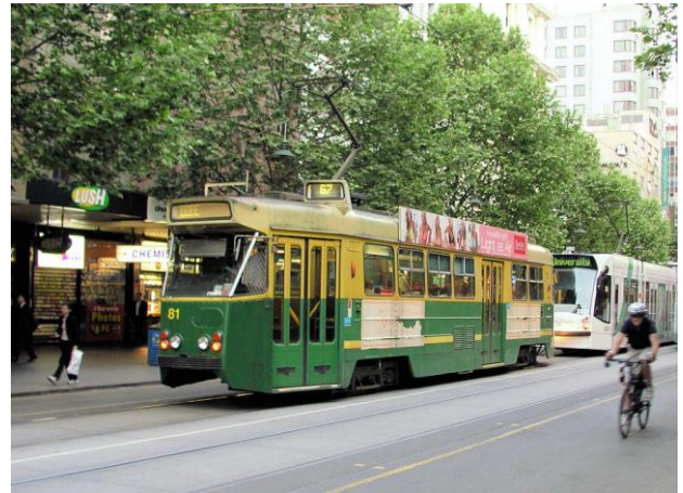
A rather tired looking Z1 81 towards the end of its service career, behind a Combino in Swanston Street on 27 October 2005.

So if you want to build up your research skills, come to the first meeting at 9:30 am on Saturday 8 August, and join in our project group.