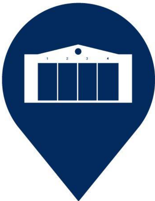
Open House symbol for Melbourne Tram Museum @ Hawthorn Depot.

If members are able to help on either or both days, please contact Carolyn on (03) 9877 4130, or send an e-mail to info@trammuseum.org.au .