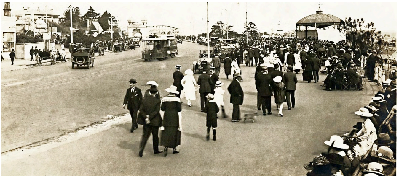
The Esplanade, St Kilda (post 1912) after the construction of Luna Park.

It appears that retail shops began replacing houses in Acland St before WWI. The distinctive European culture of the street came with post WWII immigration.