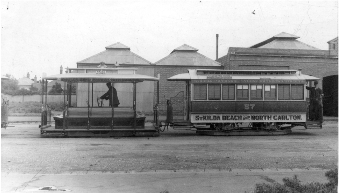
A cable tram set in Acland St outside the tram sheds, 200 metres from Barkly St (c1910-20). The rooftop sign on the car promotes connections with electric trams to Malvern, East St Kilda & Brighton.

Cable trams commenced service along the southern part of Acland St, St Kilda in 1891. Electric trams took their place in the last days of 1925.