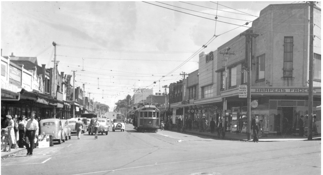
ABOVE: W2 568 arrives at a busy Acland St terminus (c1954). Note the shunt located on the eastern side of the street, a tram driver crossing the road towards the camera (right) and the VR tram tracks in Barkly St (foreground).