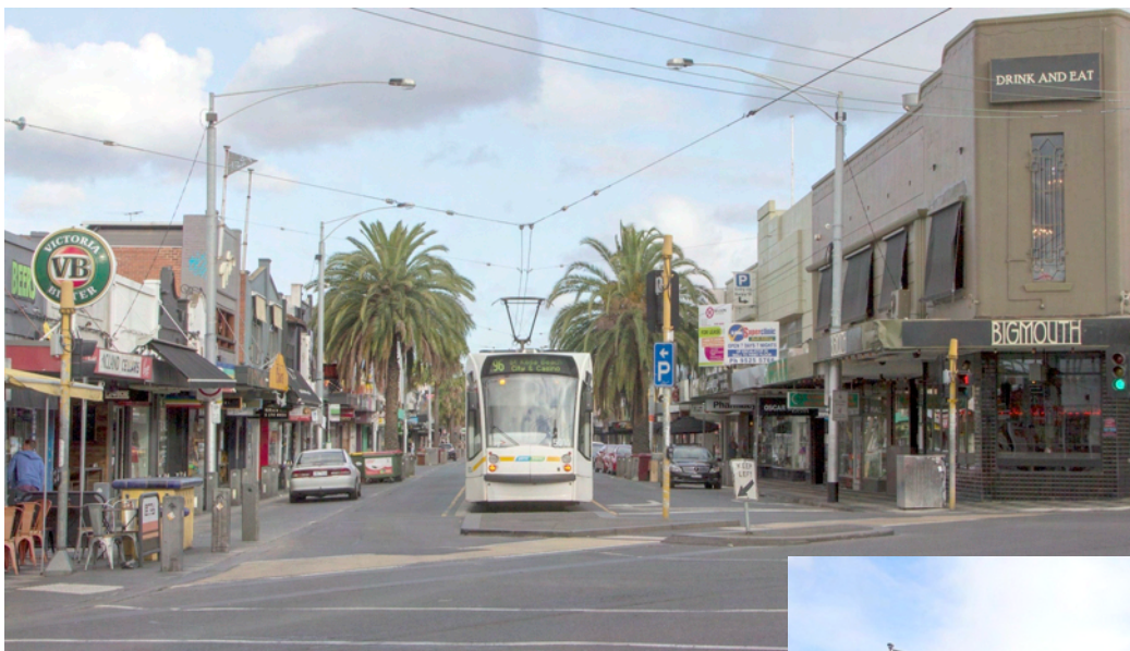
LEFT: A quieter Acland St terminus in January 2015 as D2 5014 awaits departure.