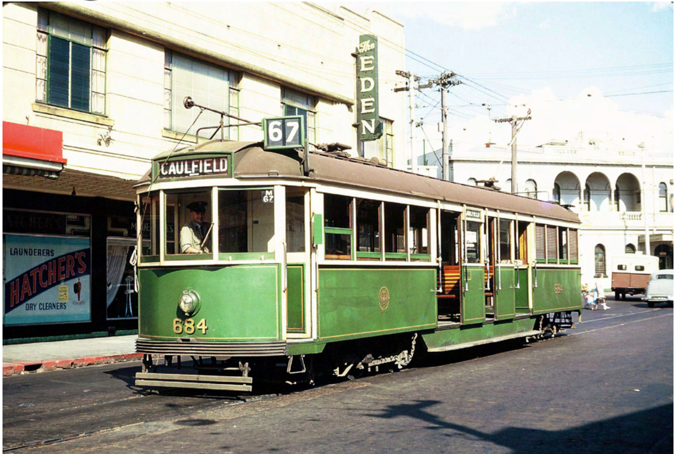
CW5 684 at Acland St terminus awaiting departure for Balaclava Junction via Dandenong Rd (c1953-4). In 1955 this route was discontinued and in 1956, 684's maximum traction bogies were replaced with standard MMTB bogies. Note the shunt's alignment to the eastern side of the street.

Journal of the Friends of Hawthorn Tram Depot