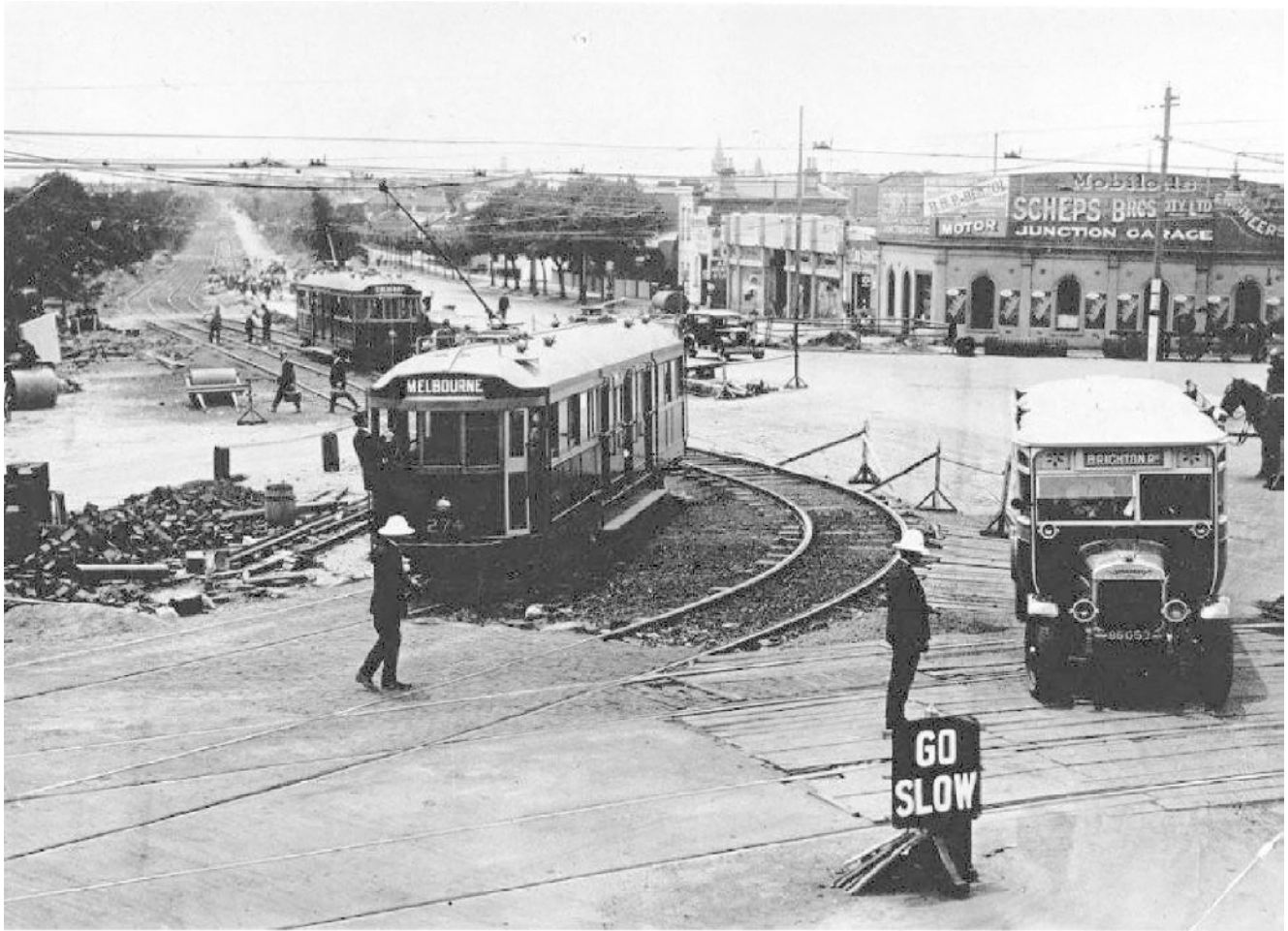
St Kilda Junction (c January 1926) (We hope to publish more of Ron's collection in future issues.)

ABOUT THIS PHOTO: W 274 in brown & cream livery on its way from Acland St terminus to "Melbourne" via temporary track along St Kilda Rd, a deviation via Park, Hanna & Sturt Sts, then Princes Bridge and Swanston St. Bus 53 in green & cream livery is a new Thorneycroft Boadicea on its way to the former Brighton Rd cable tram terminus. It is one of 56 buses obtained by the MMTB for cable tram replacement services. Rod Atkins