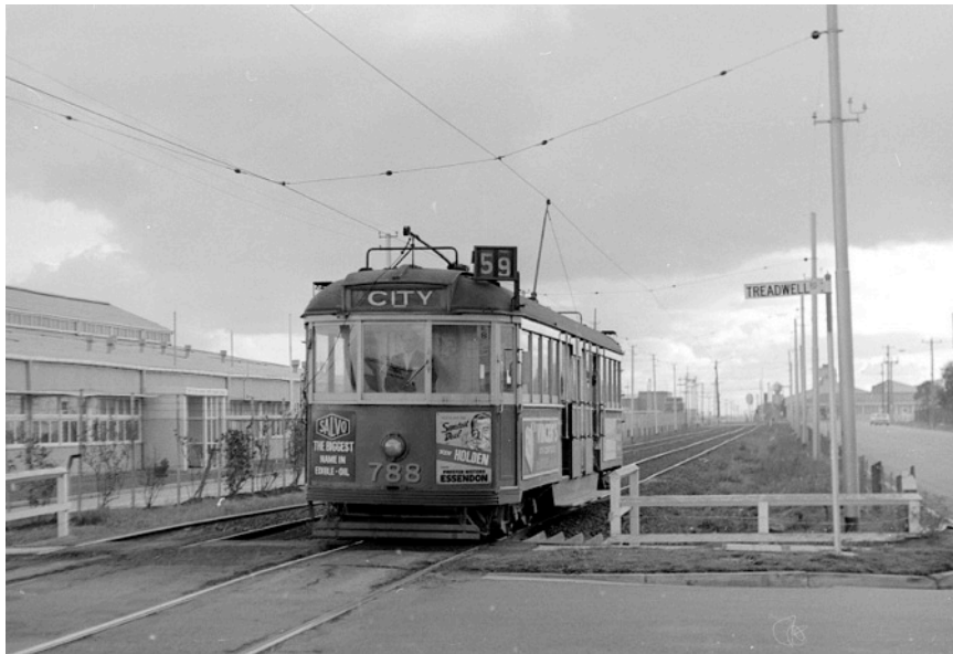
W5 788 departing Essendon Aerodrome and crossing a cattle grid at Treadwell Rd (1967). These grids were a feature of the various WWII reserved track tramways, indicating the rather rural nature of the localities at the time of construction.