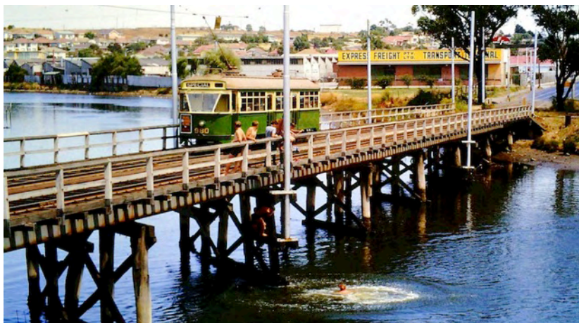
Maribyrnong River tramway bridge (1963).

In 1950 the service along Raleigh Rd was down to 26,572 round trips a year.