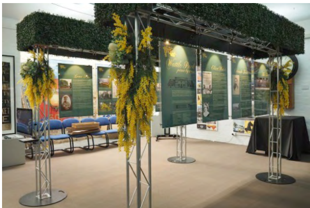
'Wattle Park: picnic by tram' exhibition