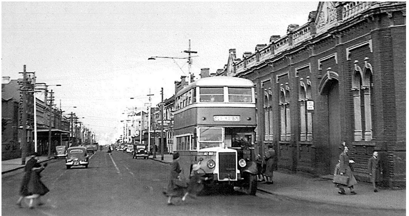
One of the M&MTB's Leyland Titan double deck buses takes on passengers in Gertrude St, Fitzroy bound for Spencer St via Bourke St (late 1940s-early 1950s).