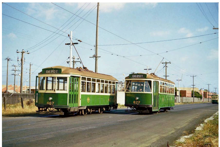
Footscray single truckers 487 and 677 arriving in convoy at the Gordon St terminus for end-of-shift workers at the Ammunition Factory (early 1950s)

The annual round trip numbers for 1942 are not available, but by 1950 the Aerodrome extension was served by 30,000 round trips a year. The overall