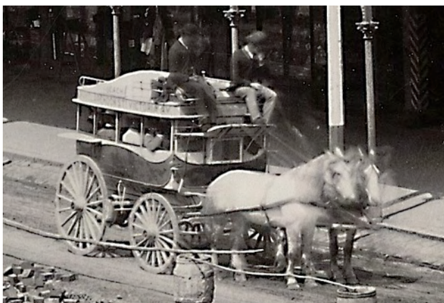
MTOC horse omnibus in Clarendon St, South Melbourne (1888) at the time William Cassidy drove the route. This is a magnified section of a photo included in Bellcord, December 2018. Note the motion blur of the reins and horses.

The buses were seldom robbed but there was a sensation around 1900 when a horse tram was 'held up' at the corner of Power Street and Riversdale